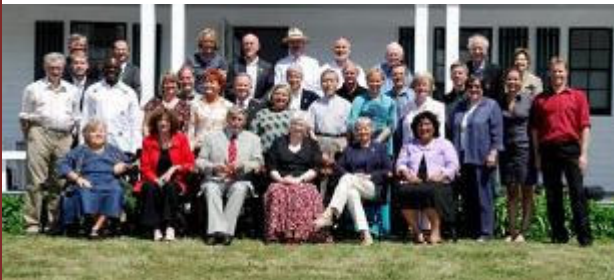
PARTICIPANTS OF THE 2008 CONFERENCE

Representatives of the PNND came from all around the world, including such countries as New Zealand, the Marshall Islands, Germany, Japan, Norway, Russia and Tanzania, among others. We were also fortunate to have present the Norwegian Minister of Defence, Anne-Grete Strøm-Erichsen, as well as the Australian Minister of Defence, Warren Snowdon.