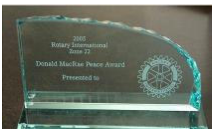
Donald MacRae Peace Award